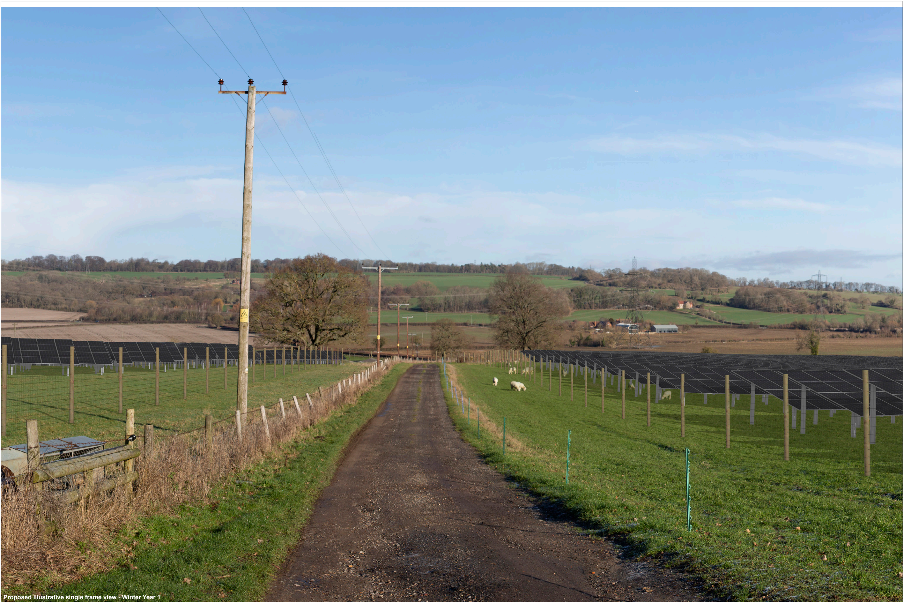
Proposed illustrative single frame view - Winter Year 1