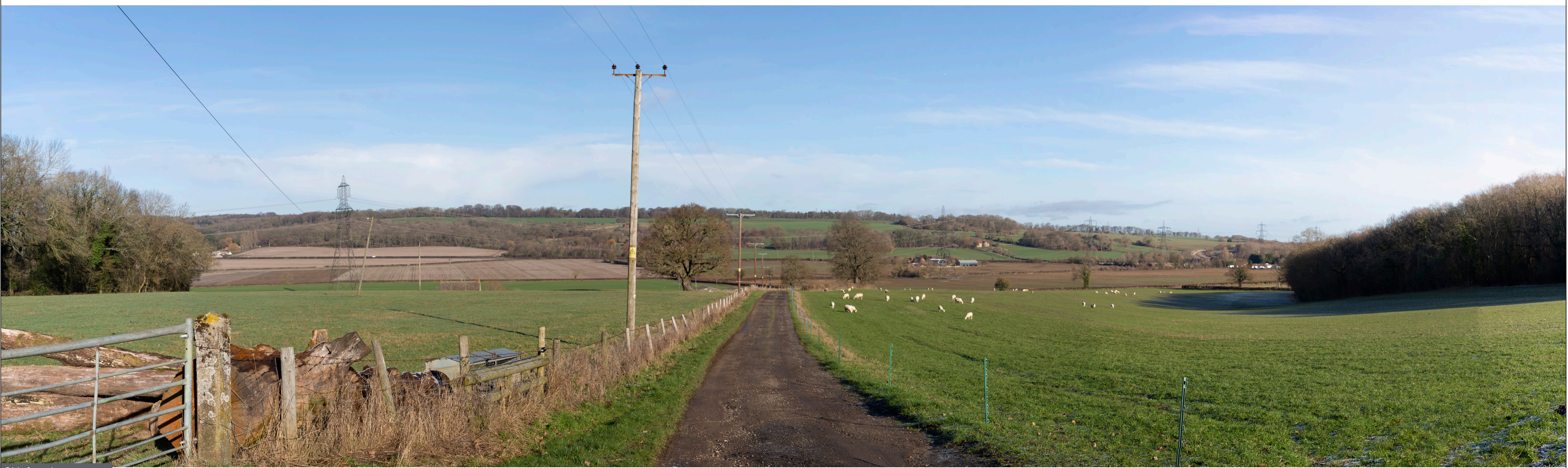
Existing Summer view