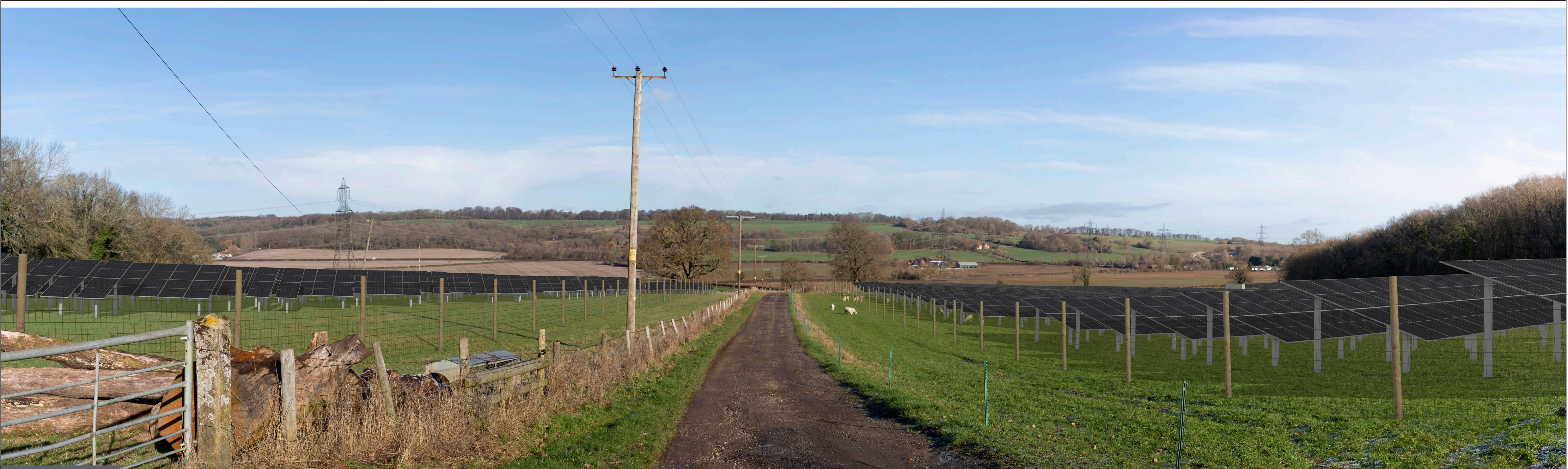
Proposed illustrative view - Winter Year 1