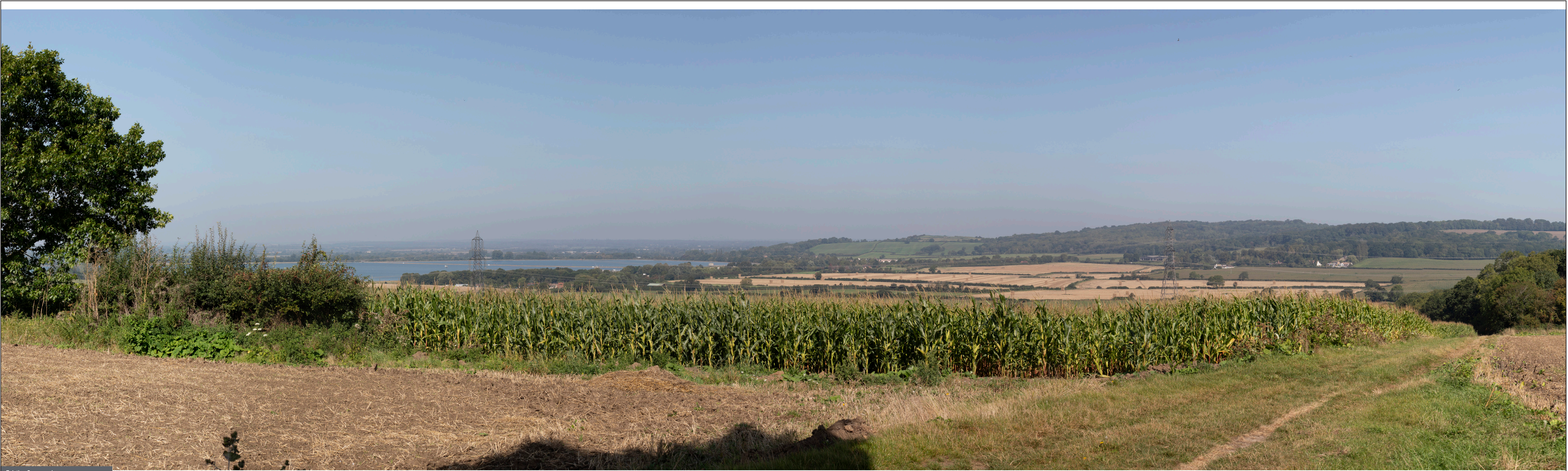
Existing Summer view