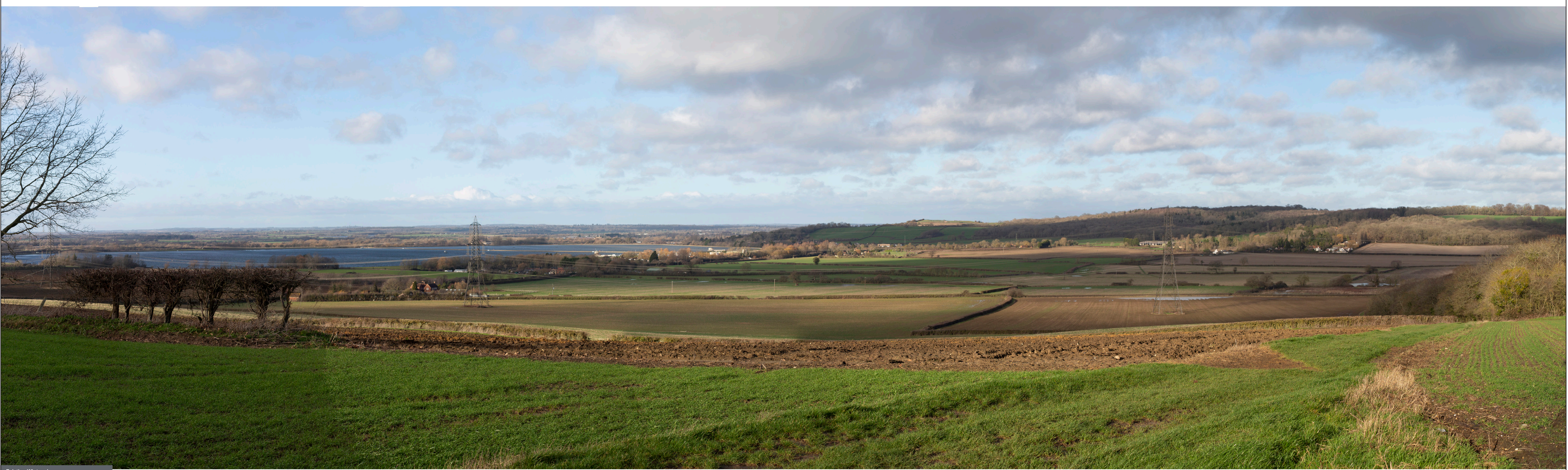
Existing Winter view