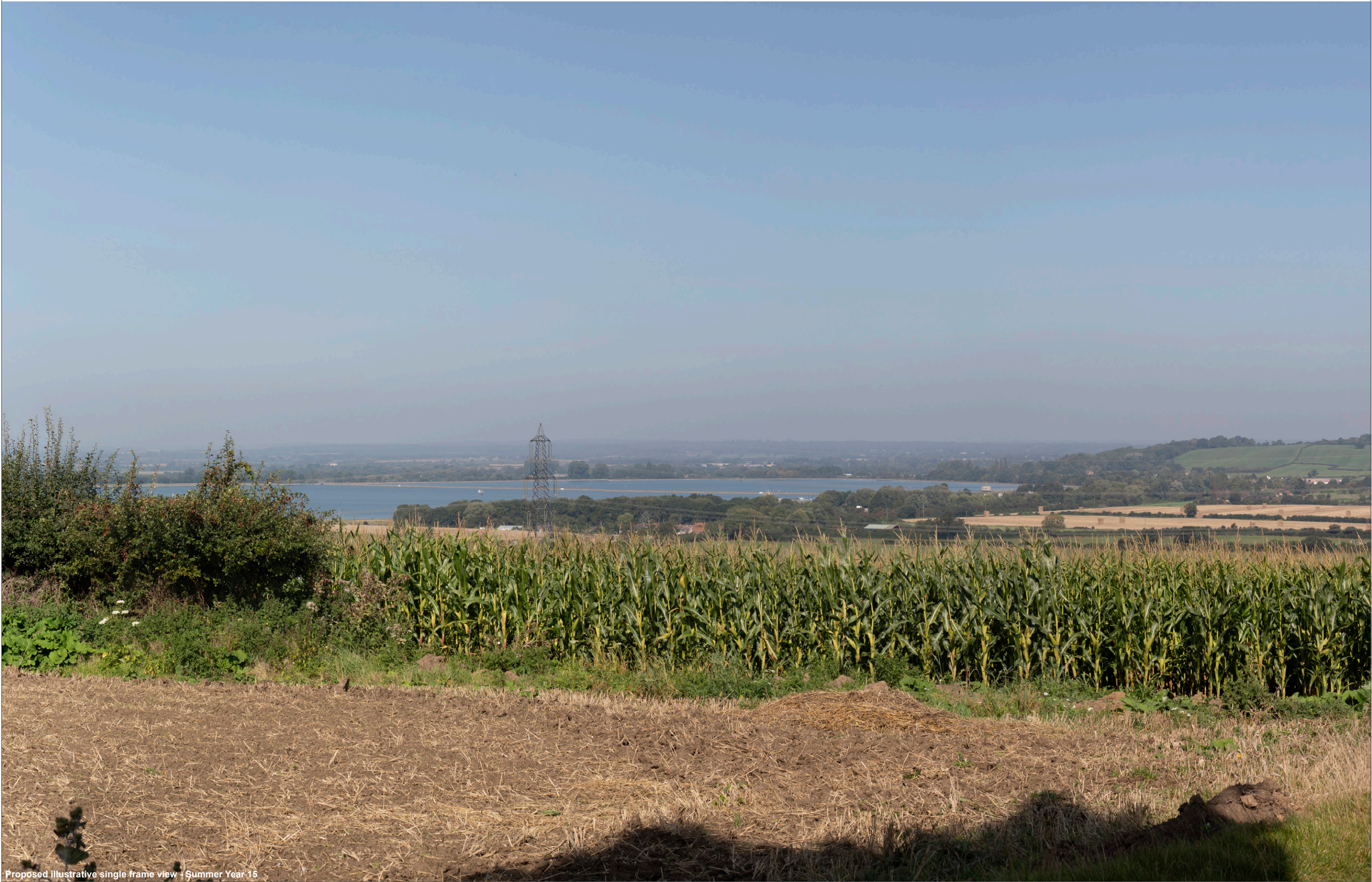
Proposed illustrative single frame view - Summer Year 15