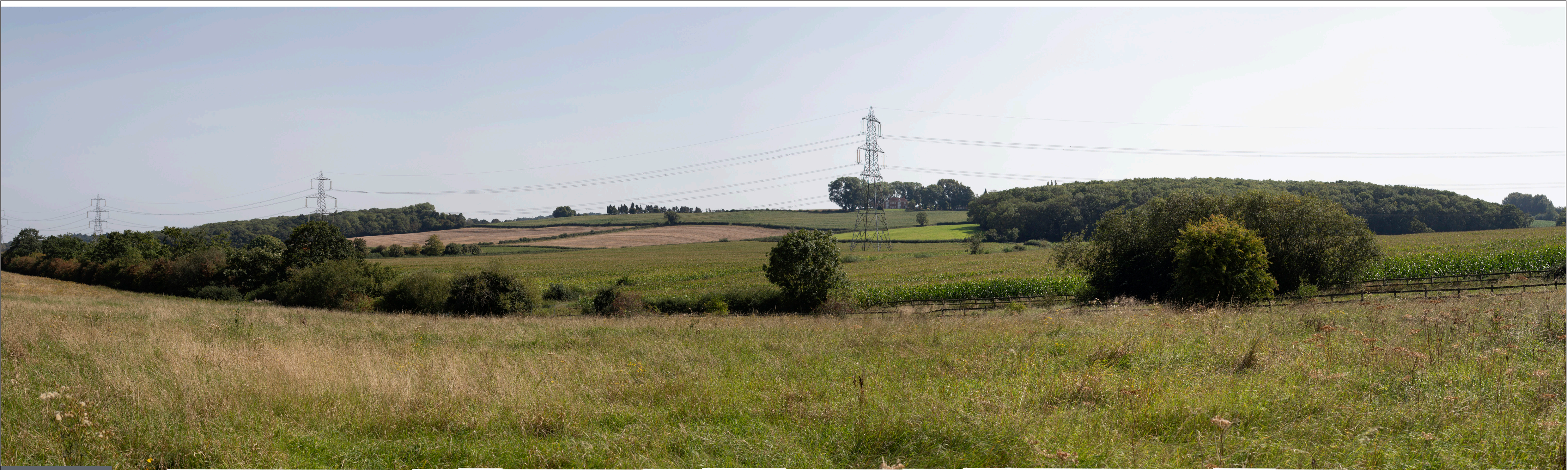
Existing Summer view