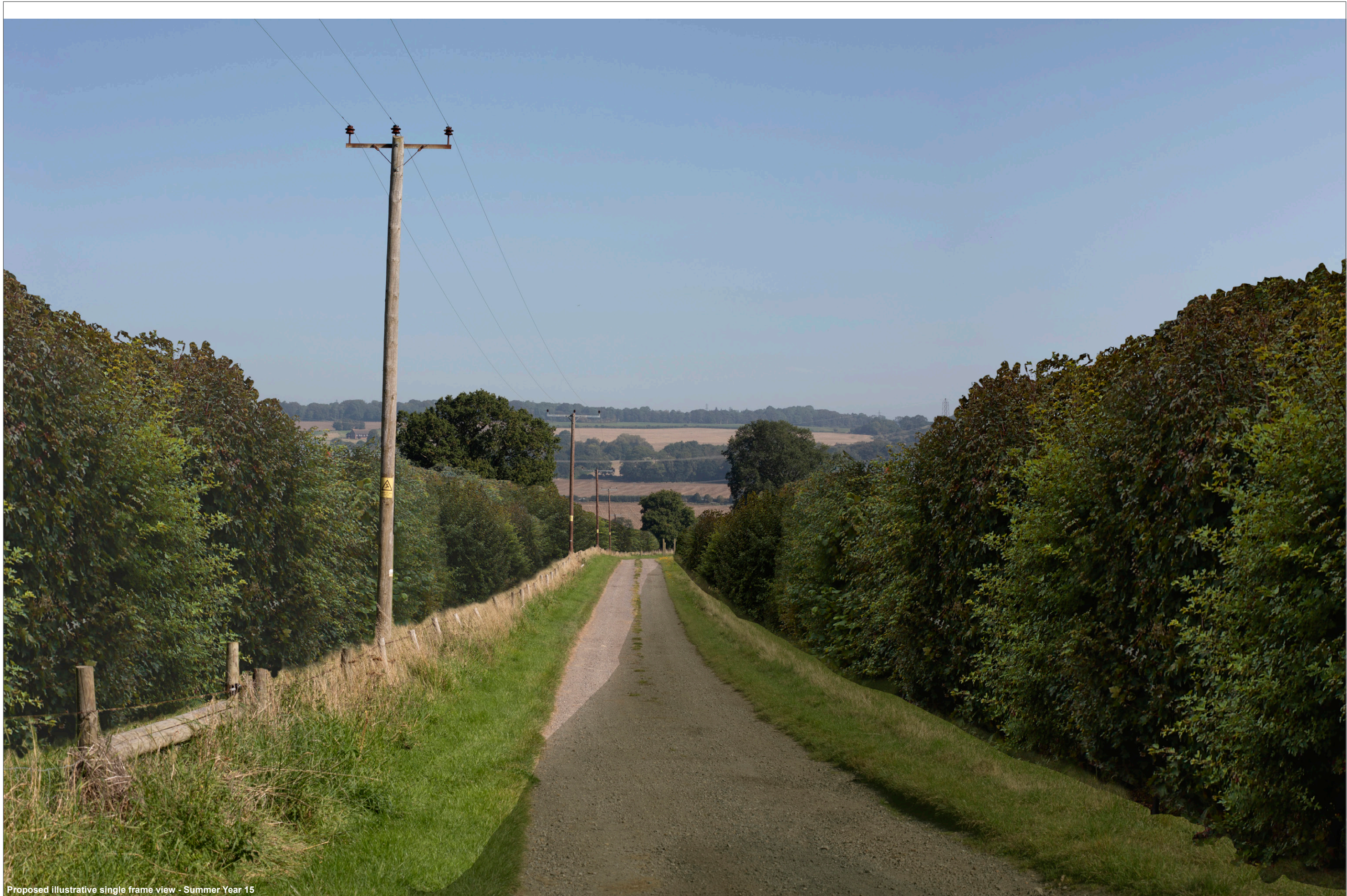
Proposed illustrative single frame view - Summer Year 15