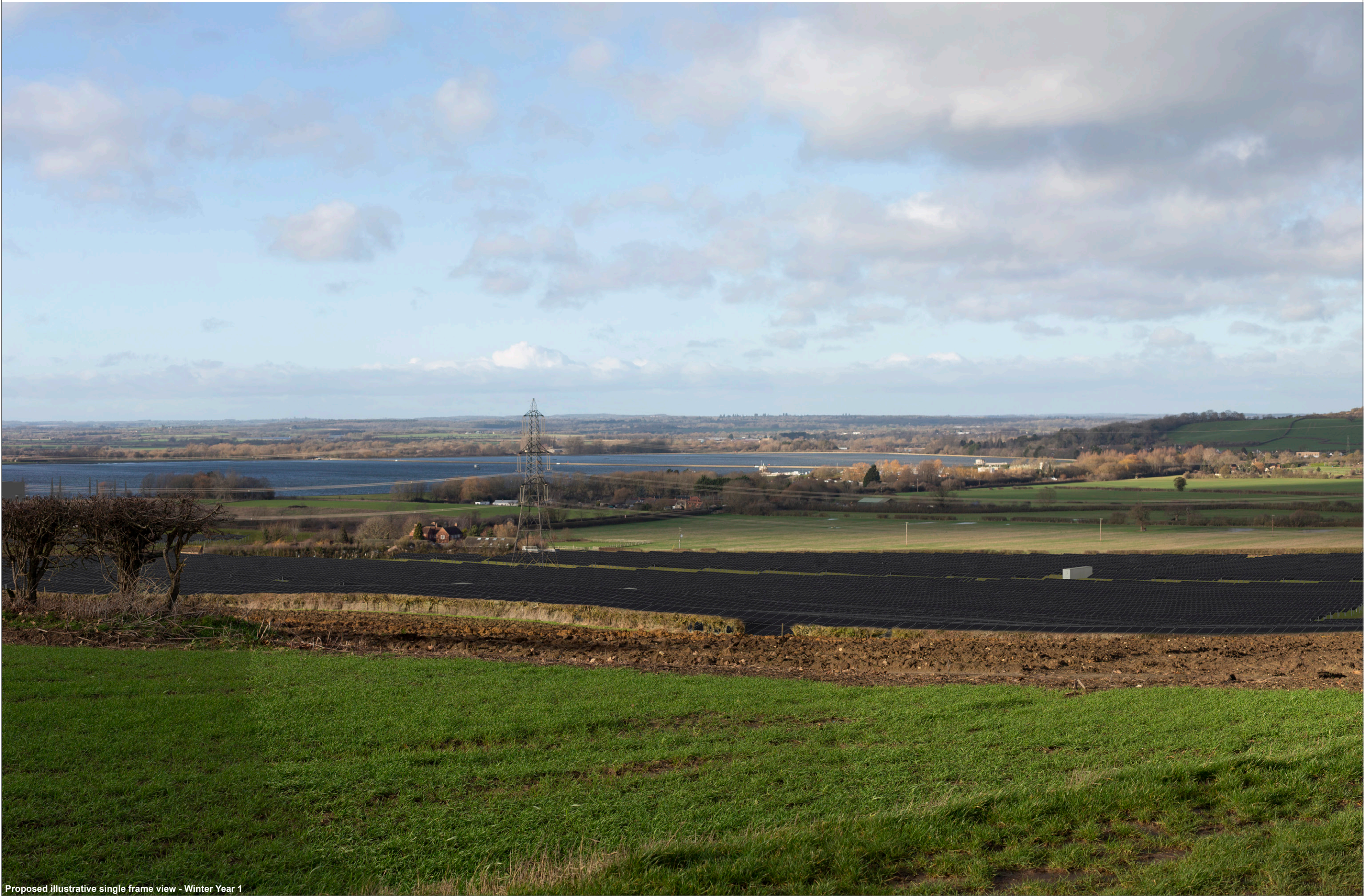
Proposed illustrative single frame view - Winter Year 1