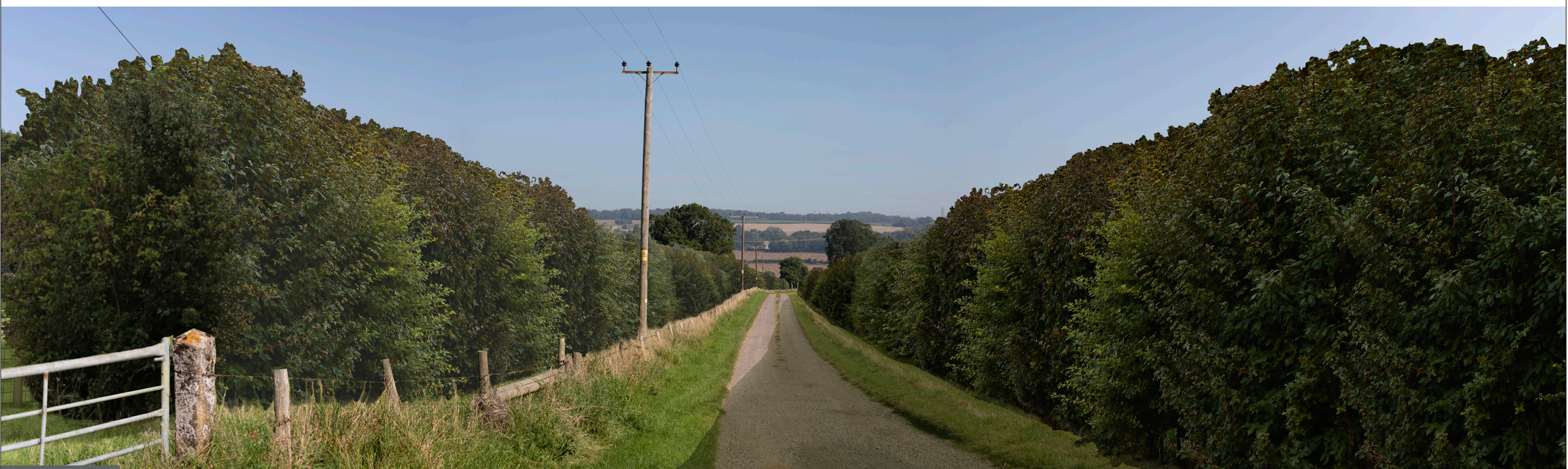
Proposed illustrative view - Summer Year 15